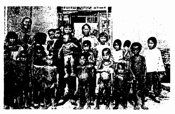
A few children who don't go to school in Hong Kong, China.

We praise God for having a little share in the evangelization of the great heathen world, but we earnestly ask our readers to pray with us that the hands of God's children in the home field may not become slack and that they may not become weary with their part in the seed-sowing. "Workers together" are we and whether at home or abroad, we must alike strive to measure up to the standard required of us by the Lord of the harvest.