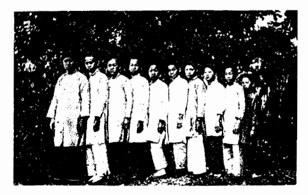
Some of the girls who attend a Christian school.